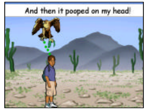
Good News Walk: IntelliPics Studio 3 AAC-D 04 CD

Natural Environment: Be sure to move this to the natural environment as soon as possible!